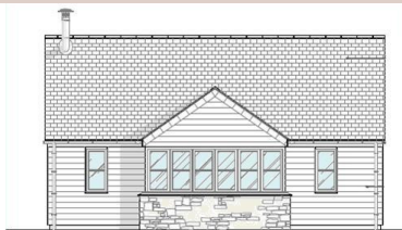
Plans of The Croft.

There is also a modern, well equipped kitchen with dishwasher, a large lounge-diner with log burner, comfortable seating area, digital TV & DVD player, dining table and chairs for six and views across the farm to the sea. Outside is a sheltered garden with picnic table, sun loungers and a BBQ.